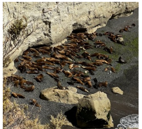
Sea Lions bathing in the sun a few miles from Puerto Madryn.