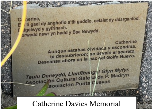
Catherine Davies Memorial