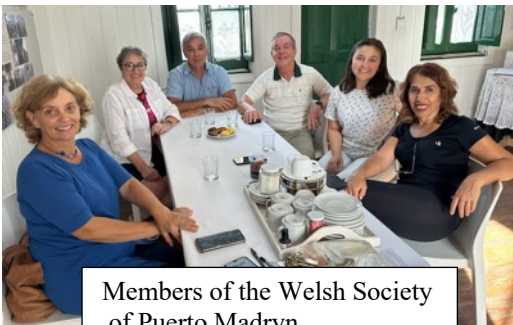
Members of the Welsh Society of Puerto Madryn