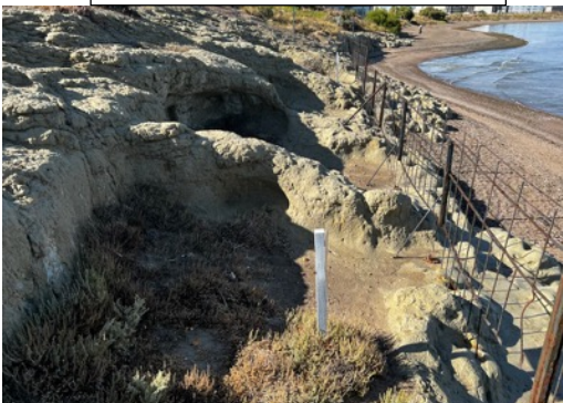
The remains of 16 sleeping quarters carved into the soft volcanic rock and used for a few days by the Welsh on landing