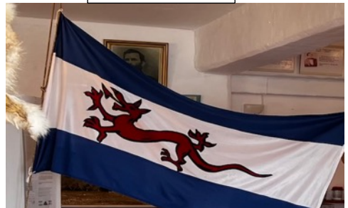
The Welsh Flag of Patagonia designed in Aberystwyth in 1852 before the Welsh sailed to Patagonia